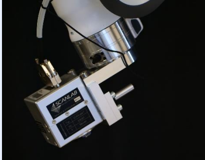
Figure 1: Galvanometer Scanner mounted to an industrial robot

Philipp Walderich Telefon +49 241 80 40423 philipp.walderich@llt.rwth-aachen.de